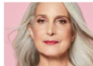
Model has deep-set eyes and square-shaped face.